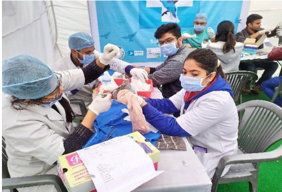
Figure 4: Veterinarians examining the bird upon admission and providing first aid

Another BTC was organized in collaboration The team from Hope and Beyond in