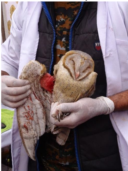
Figure 2: A barn owl being examined post-operatively

protracted care. This was possible because of the adept first aid and emergency measures the team undertook during the rescues itself. The remaining birds were brought to the two veterinary centres that were temporarily established for at least a month around Makar Sankranti. These birds were injured and required treatment ranging from dressing and bandaging of soft-tissue wounds to surgical fixations of complicate wing fractures (figure 2). Dedicated operation theatres were established in both these facilities and experienced and trained veterinarians were made in-charge of the units.