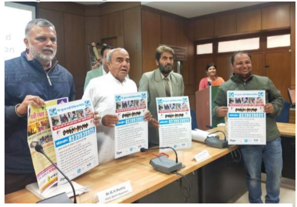
Figure 5: Minister of State, Environment and Forests, Govt. Of Rajasthan releasing a poster on saving birds during kite flying festival

An orthopaedic Operation Theatre was also