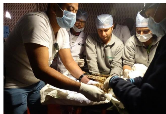
Figure 3: A team of veterinarians, bird handles preparing for surgery

Special focus was paid to maintain sterile environment, least disturbance to the bird and excellence post-operative care to improve the rehabilitation prospects of the birds (figure 3). Aviaries were also erected to ensure the birds have ample space and are able to practice flying, post-operatively to improve their chances for survival in the wild.